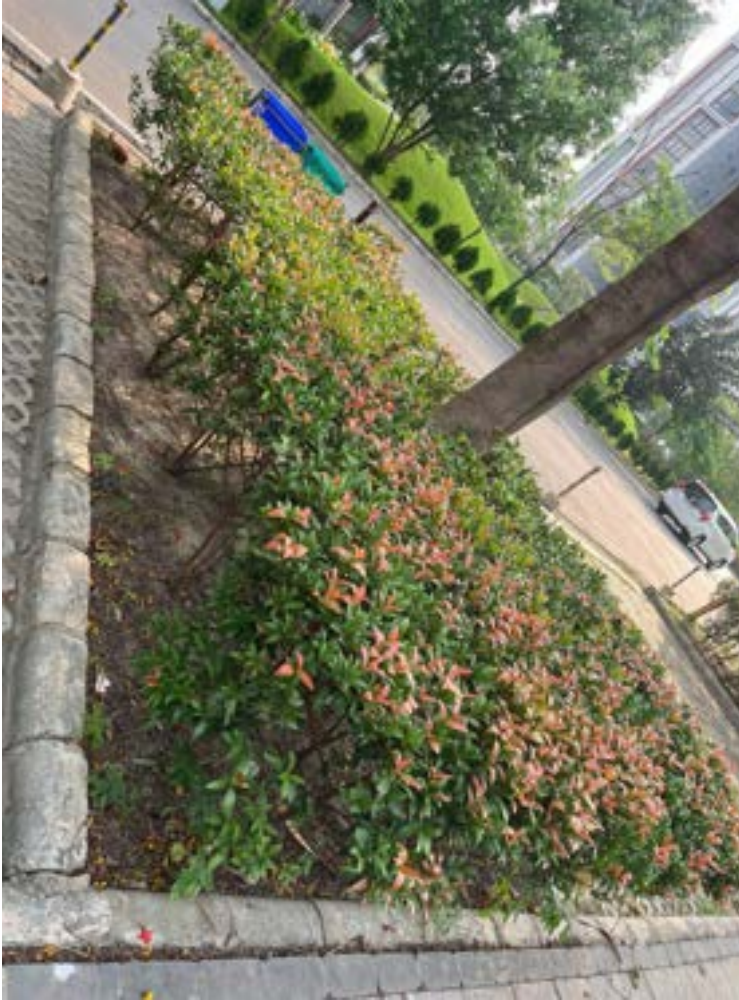
Parking Dividers on South Avenue with Syzygium

The shape of current dividers (island) is in very odd shape. Decided to plant Syzygium (similar to South Avenue) on parking dividers on North Avenue also.