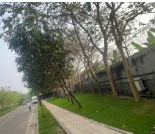
Green Grass laid from Market Area to New Pump House on Eastern flank of the Street

To make the Street to feel like passing through a Green Tunnel , multiple steps have been initiated - results expected within next six to twelve months.