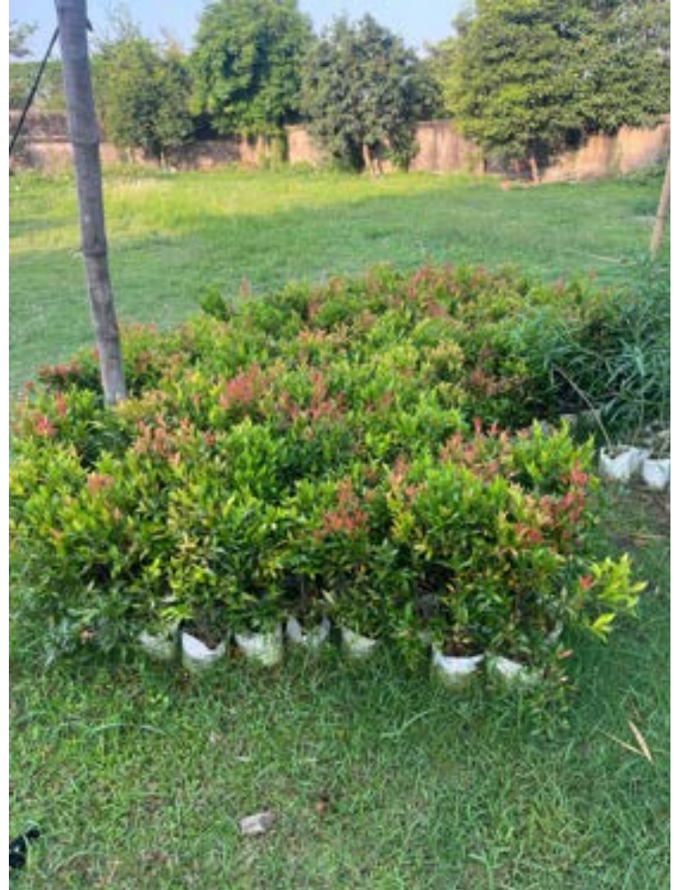
For plantation on North Avenue, Syzygium procured.

Syzygium Hedges are sturdy in nature and decent looking too