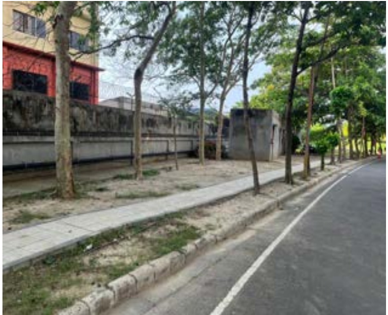
From the new Pump House upto Tower 5 Gas Station