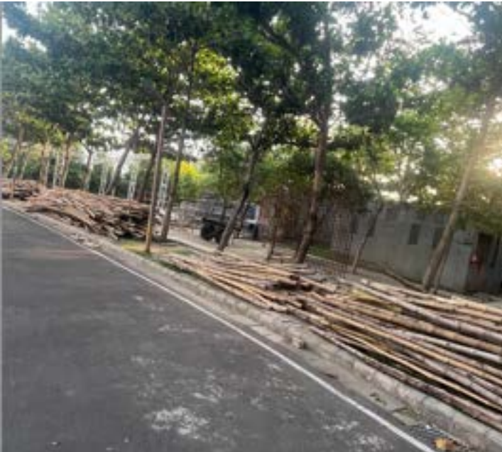
From Puja Mandap upto Bengal Gas station