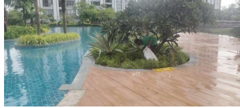
Near Swimming Pool