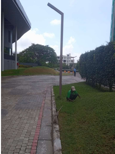
In front of Club