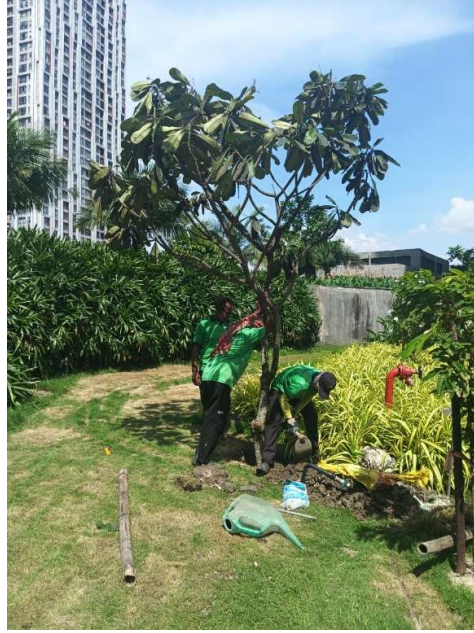
Replantation at Tower 6