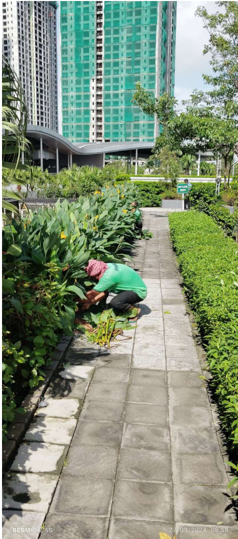
Canna Trimming -Central Garden