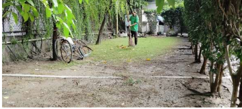
Main Gat Sweeping