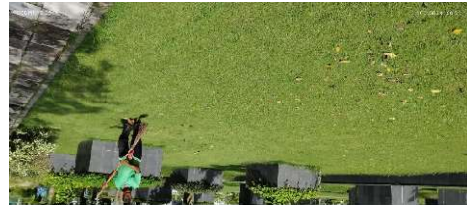
Central Garden sweeping