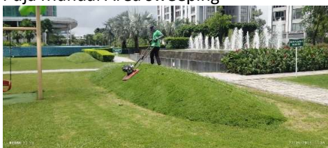
Mound mowing at Central Lawn