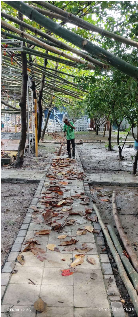
Puja Mandal Area sweeping