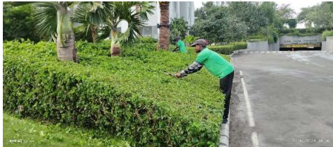
Tower 4 Hedge Trimming