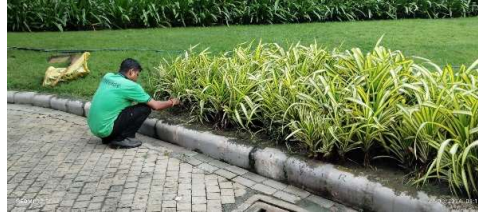
Tower 2 : weeds cleaning