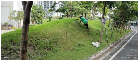
Tower 5: weeds cleaning