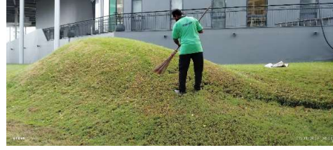
Club Mound sweeping