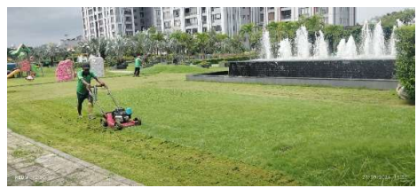
Grass mowing at Central Lawn