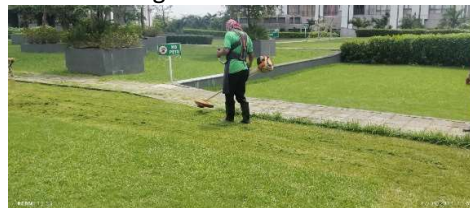
Brush Cutter at Central Garden

Gardeners takes lunch break of 30 minutes, usually 10.00 to 10.30 AM. They get leave on Sunday.