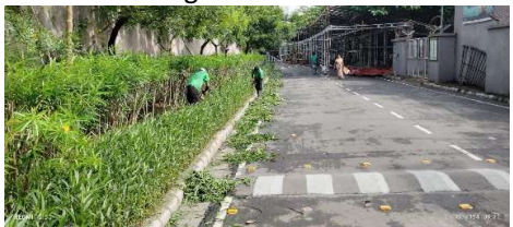
Hedge Trimming (opp. to Bengal Gas)